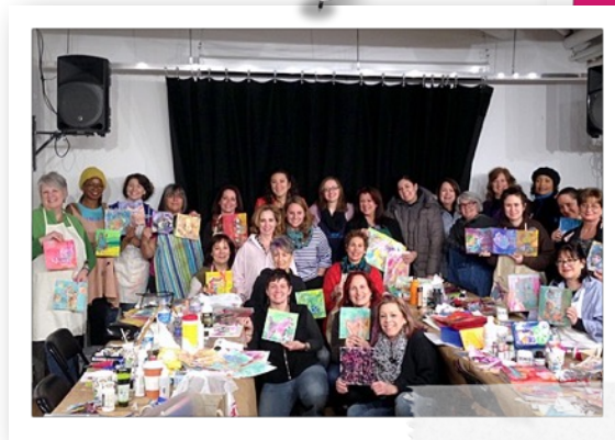
Taste of Collage Workshop at

For me, creating art is a dialogue between my skills and the supplies I use. It is not so much a battle as an ongoing attempt to work out the