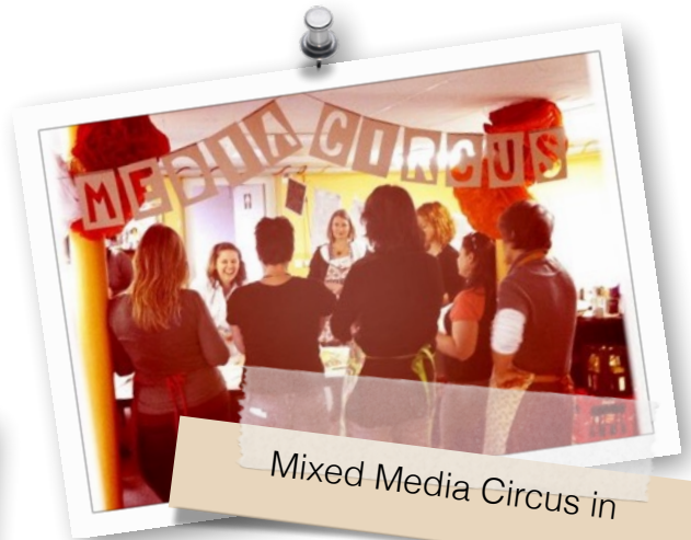
Mixed Media Circus in

Teaching is about connecting with other artists and helping them towards creative