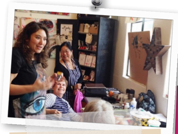
Magazine Magic, Santa Ana,

For me, creating art is a dialogue between my skills and the supplies I use. It is not so much a battle as an ongoing attempt to work out the