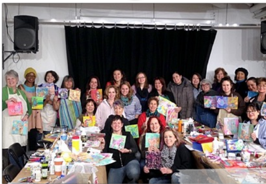
Taste of Collage Workshop at

For me, creating art is a dialogue between my skills and the supplies I use. It is not so much a battle as an ongoing attempt to work out the