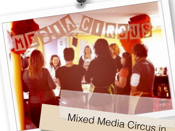
Mixed Media Circus in

Teaching is about connecting with other artists and helping them towards creative