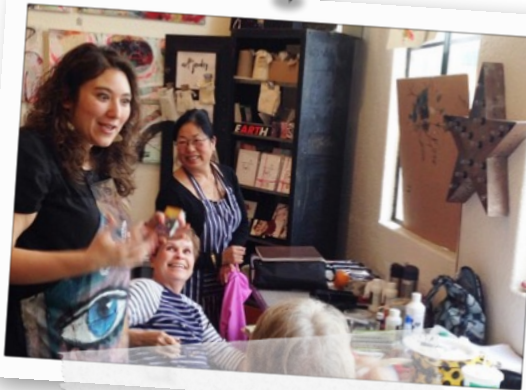
Magazine Magic, Santa Ana,

For me, creating art is a dialogue between my skills and the supplies I use. It is not so much a battle as an ongoing attempt to work out the